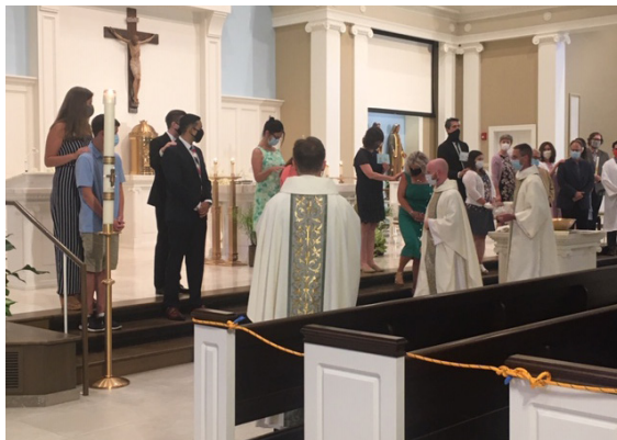
Spring 2020 Newly Initiated Adults to St. James Parish

Are you looking to complete your sacraments of initiation?