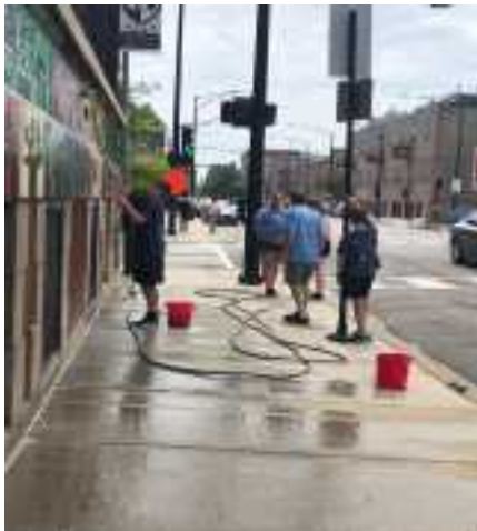
Local Mission 2019