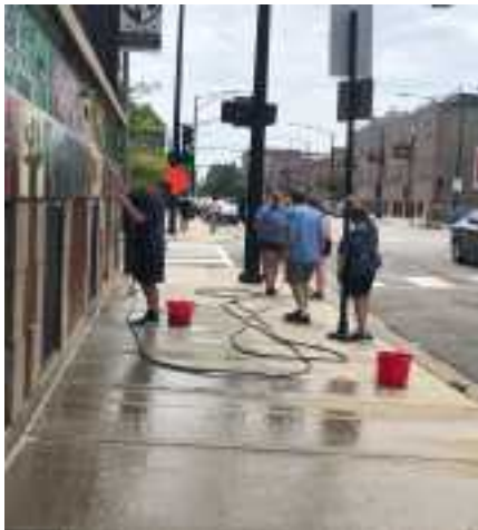
Local Mission 2019