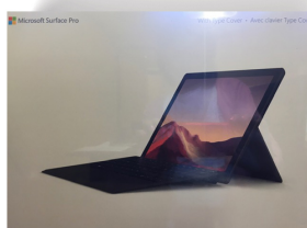
Microsoft Surface Pro Tablet