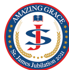
2 tickets & 2 raffle tickets for Jubilation 2021