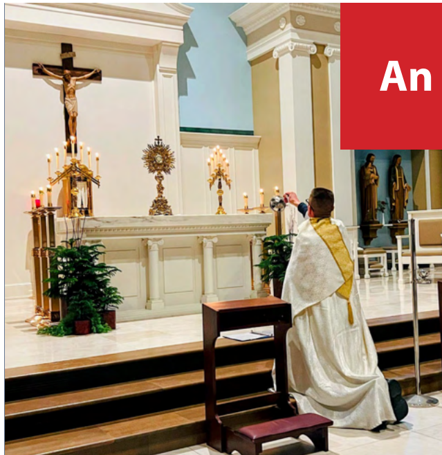
Next Encounter - March 29 at 5:30 pm

Monday April 4 – 7:30 – Our Lady of the Wayside • Tuesday April 5 – 3:00 – St. Edna and 7:30 – St. Mary Wednesday April 6 – 7:30 – St. James • Thursday April 7 – 3:00 – St. Colette