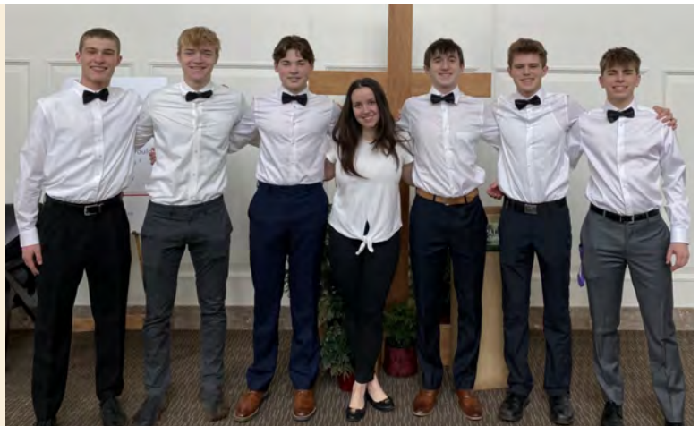
Meet some of your serving staff for the evening

Full Cash Bar including Free Refills On Soda