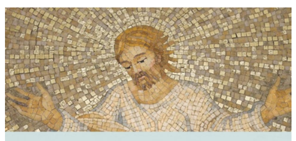
Meeting Mental Health With Grace MENTAL HEALTH MINISTRY

St. James, Our Lady of the Wayside & St. Edna's Parishes