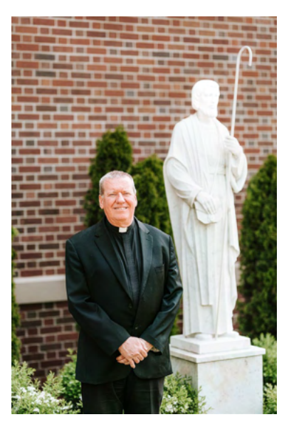
We appreciate your support and look forward to this special event!