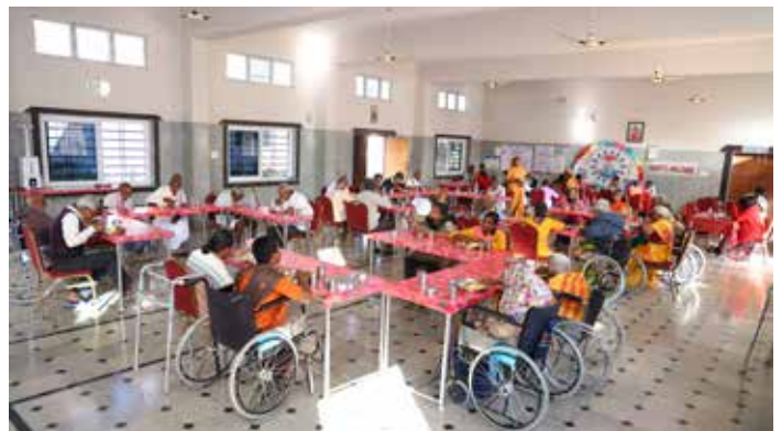
Residents of the F.C.N. Home

Please visit our website to learn more. www.fcn-usa.org Call 847-670-1145 or email tomchitta@hotmail.com