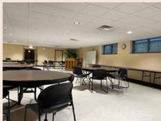
The O'Brien Room (in the lower level of the Parish Center) will be converted to a gross motor room for our youngest students.

JOIN US FOR THE VITAL LEGACY : VATICAN II CONSTITUTION ON THE CHURCH (LUMEN GENTIUM)