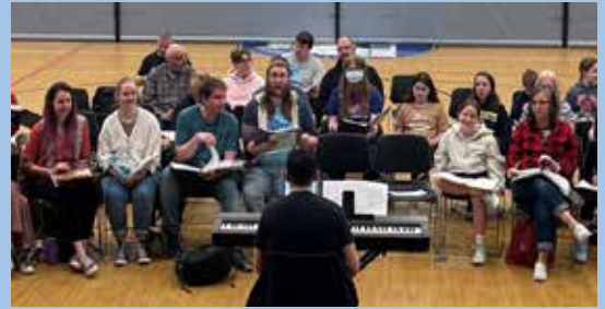
Big Fish cast members are eagerly preparing this year's summer musical!

IN THE SCHOOL GATHERING SPACE FROM 6:30 - 8:00 PM