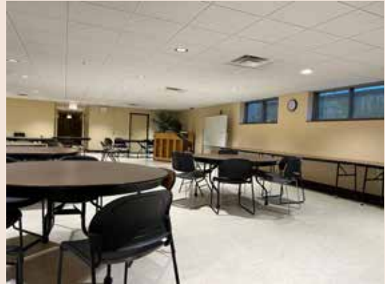
The O'Brien Room (in the lower level of the Parish Center) will be converted to a gross motor room for our youngest students.