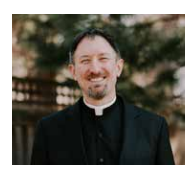
It's the End of the World as We Know It