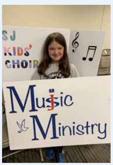
Let your light shine before others, that they may see your good deeds and glorify your Father in heaven. ~ Matthew 5:16