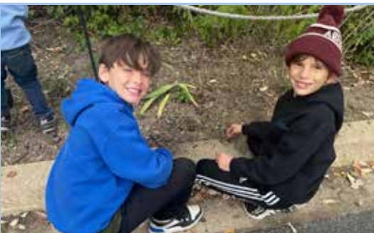
Photos from the first meeting of the new Jr. Ambassadors group.

Let your light shine before others, that they may see your good deeds and glorify your Father in heaven. ~ Matthew 5:16