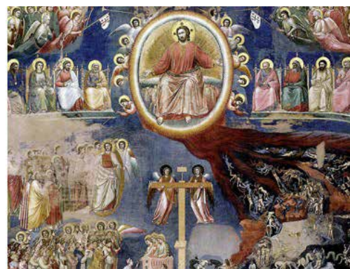
Giotto: The Last Judgment