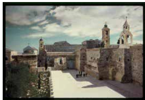
Manger Square and Church of the Nativity, Bethlehem