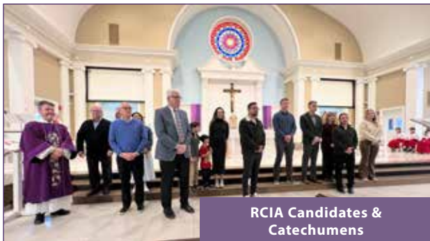
RCIA Candidates & Catechumens