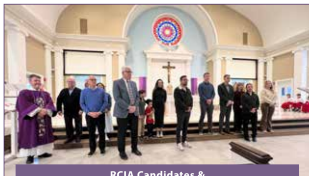
RCIA Candidates & Catechumens

In the Parish Center: 8:15 a.m. Mass 10:15 a.m. Mass 12:00 p.m. Mass