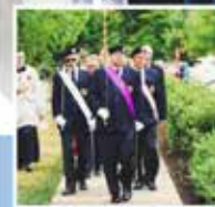
Procession after 11:30 mass towards North Park

Come walk with Christ in the longest procession in St. James' history as we make our way towards North Park and back for Benediction.