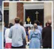
Benediction at St. James after procession.

See route and details here stjamesah.org/corpus-christi/