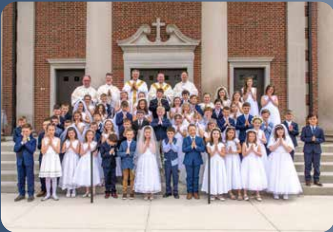
First Holy Communion - Religious Education 11:00 a.m. Mass