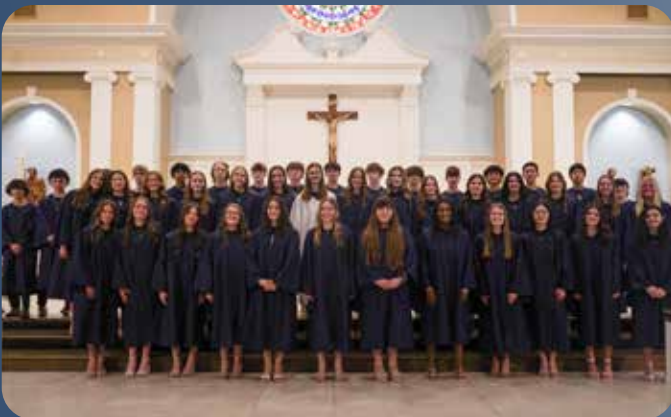
May Crowning - St. James School 8th Grade Class