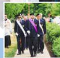
Procession after 11:30 mass towards North Park

Light refreshments after Benediction provided by Women of St. James