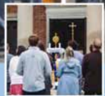
Benediction at St. James after procession