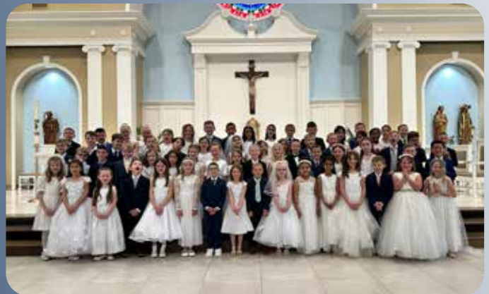
First Holy Communion - St. James School 2nd Grade Class