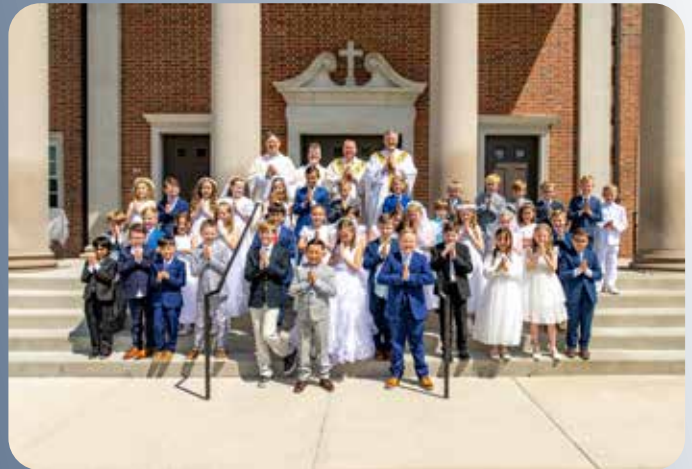
First Holy Communion - Religious Education 1:00 p.m. Mass