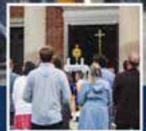
Benediction at St. James after procession