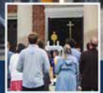
Benediction at St. James after procession