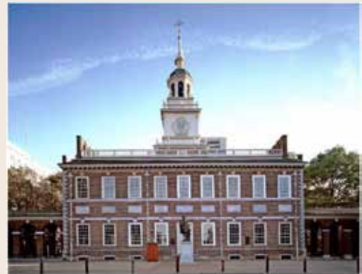
Independence Hall in Philadelphia