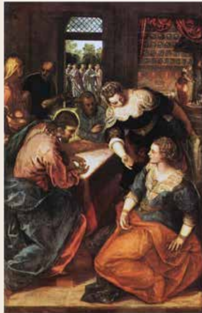
Christ With Martha and Mary - Tintoretto (1570)

The touching story of Martha's exchange with Jesus reveals His endearment towards His friend. Mary, Martha, and their brother Lazarus appear six times in the Gospels. They seem to be those good