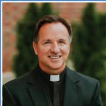
FATHER MATT FOLEY